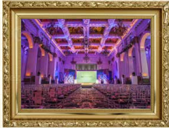
8 Northumberland Avenue