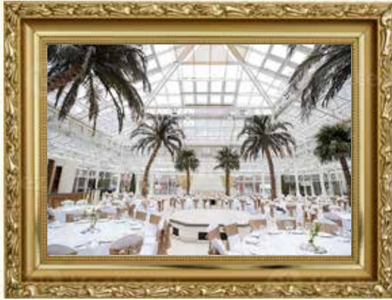
Millennium Hotel and Conference Centre Gloucester London

We proudly cater across a variety of venues, including our own, and have showcased some examples to give you an idea of the possibilities.