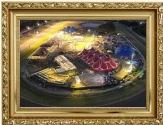
Chelmsford City Racecourse