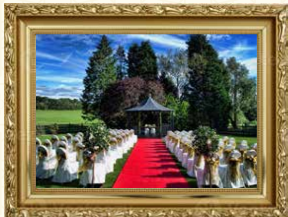
Three Rivers Club