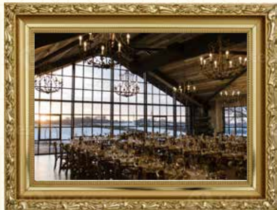
The Barn at Botley Hill