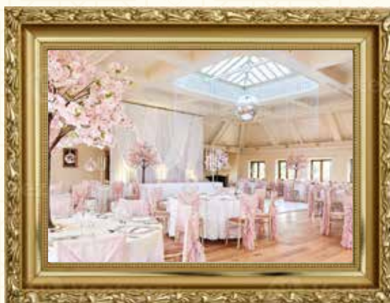
Stock Brook Manor